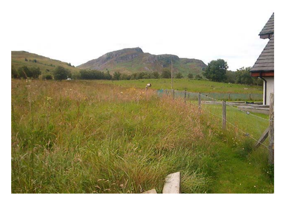
Fig. 3. Site looking west from the existing houses at Catlodge Fig. 4. Site looking east towards existing houses at Catlodge