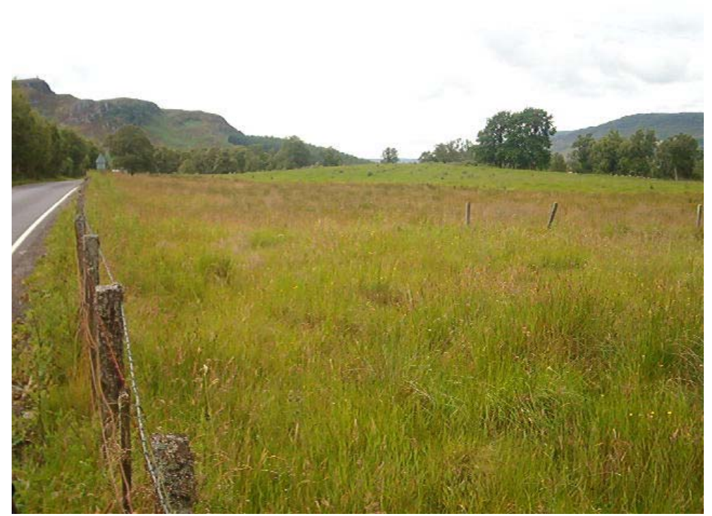
Fig. 2. Site looking west (A889 to the left of picture)